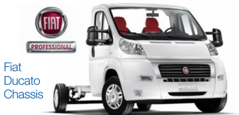
Fiat Ducato Chassis